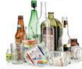
Glass Bottles & Containers Botellas y envases de vidrio