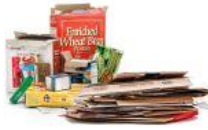
Flattened Cardboard & Paperboard Cartón y cartulina aplastados