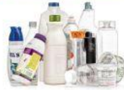
Plastic Bottles & Containers Botellas y envases de plástico